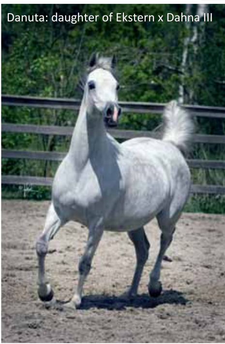
Danuta: daughter of Ekstern x Dahna III