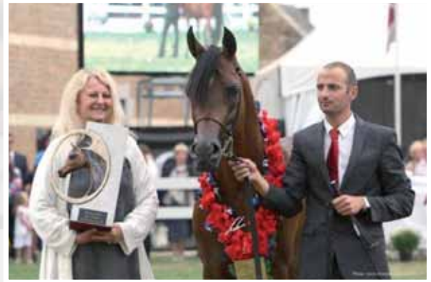
QR Marc Champion stallion at the Elran Cup 2010