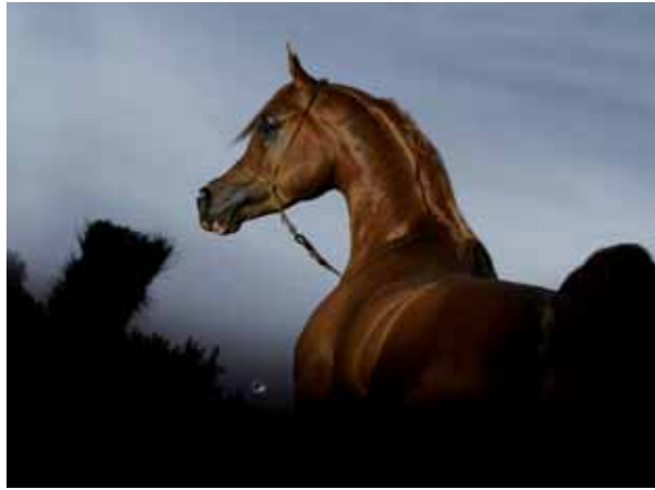
Abha Qatar: Triple crown winner 2009