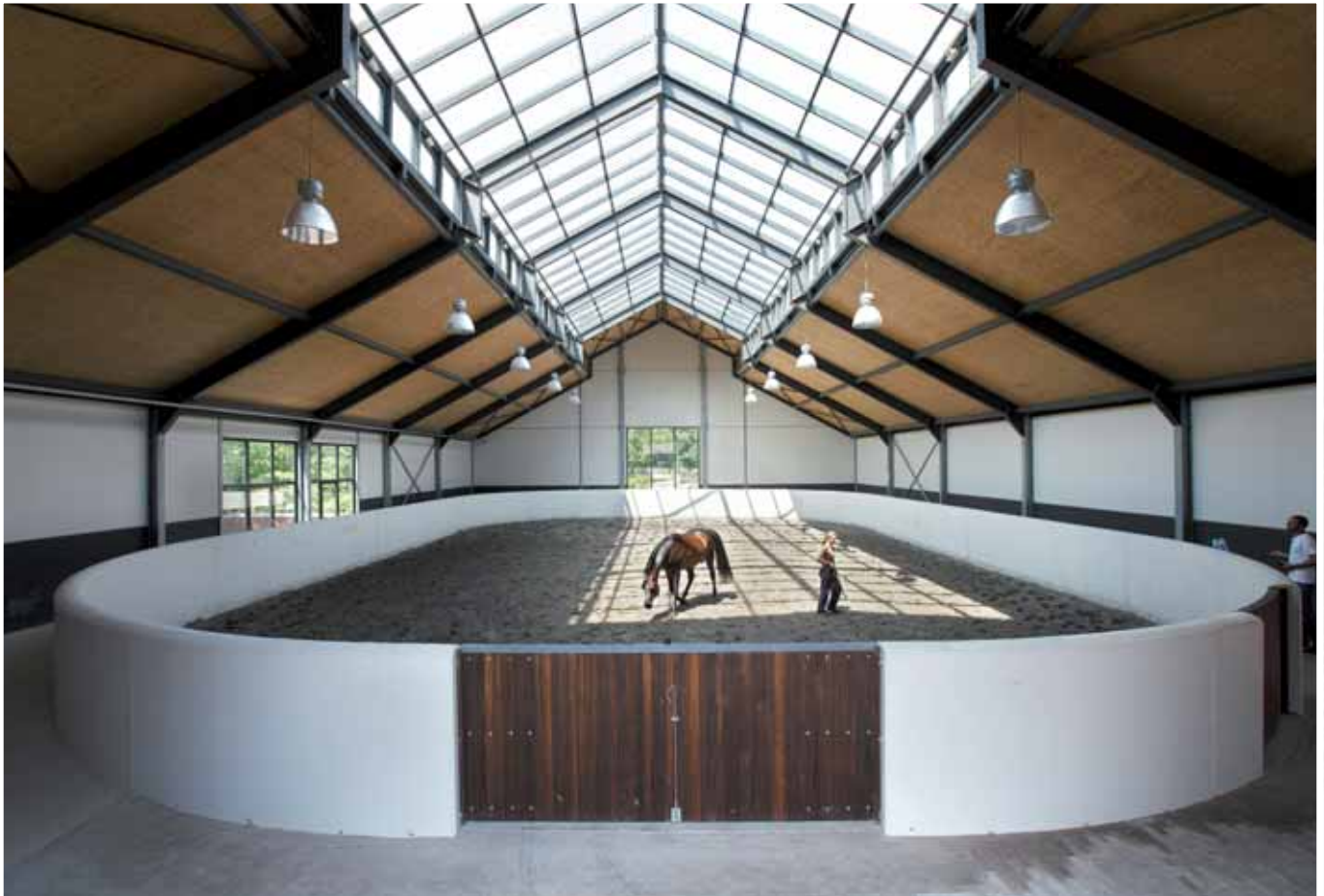
Indoor arena at Jadem Arabians

CJ: All has started with the stallions. When you have stallions and you decide on sending their semen around the world, you need to have a clinic, which meets the European Standard. First of all you have to separate the stallions from the mares. Furthermore must the washing place, the grooming area ect. be in individual spaces. Even the mares' fields and paddocks need to be disconnected from the stallion's zone. All those strict requirements lead into new structures which resulted in a bigger office for myself, a kitchen only for my staff, we have now a seminar room too where I can welcome visitors. Overall, everything became much more comfortable.