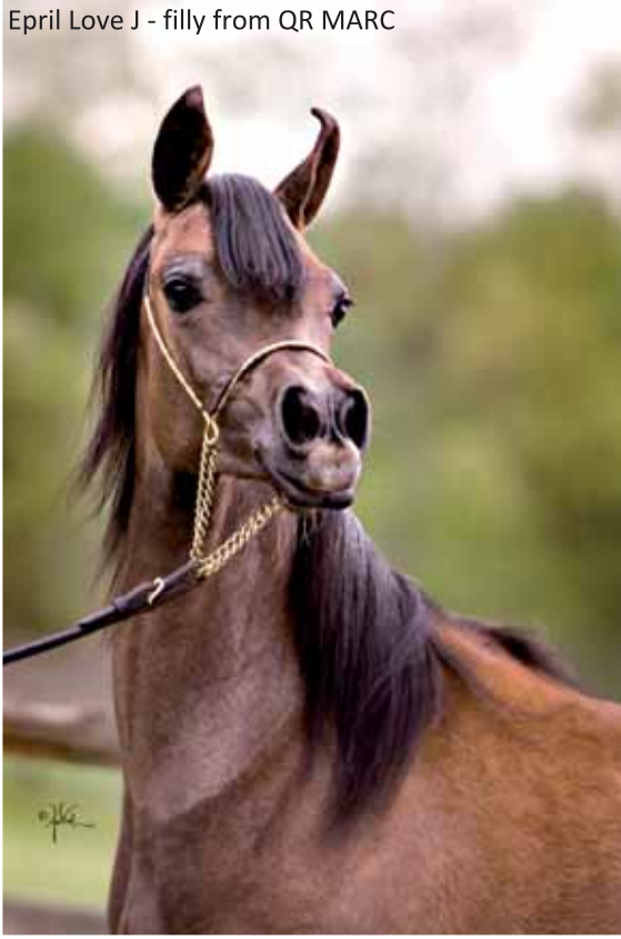
Epril Love J - filly from QR MARC