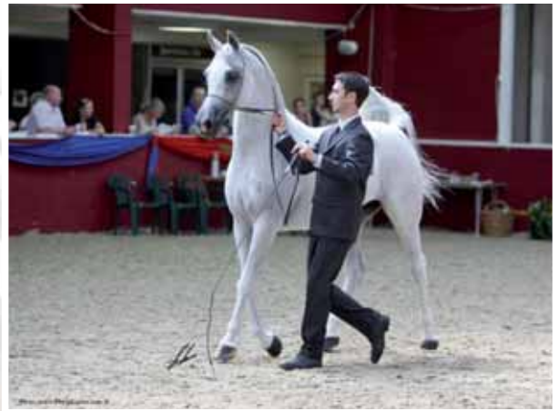
Eberia Reserve Champion mare at Towerlands 2009

RS: Please explain to the readers of TUTTO ARABI what is one of the biggest challenge while judging a renowned class or championship.